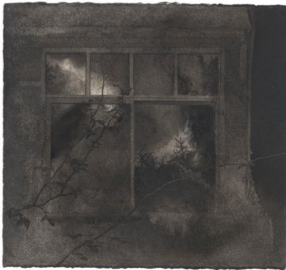
19. Reflection, 1982 pen and ink and wash on Fabriano paper image: 5 1/8 x 5 3/8", sheet: 5 1/8 x 5 3/8", frame: 11 1/2 x 11 1/2"