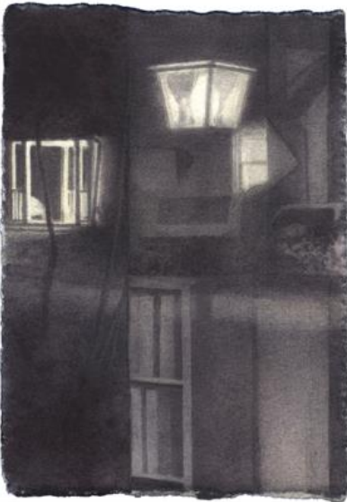
37. Three Inch Suite V: Reflections , 2005-2008 watercolor and graphite on Fabriano paper image: 3 1/8 x 2 1/4", sheet: 3 1/8 x 2 1/4", frame: 11 x 9"