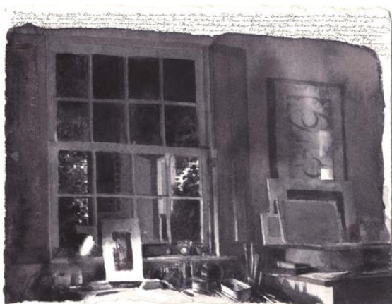
41. Window with Drawings and Chart , 2007 watercolor, graphite, gouache, and pen and ink on Fabriano paper image: 5\frac{3}{4} \times 7\frac{1}{4} ", sheet: 5\frac{3}{4} \times 7\frac{1}{4} ", frame: 12\frac{3}{4} \times 14\frac{3}{4} "