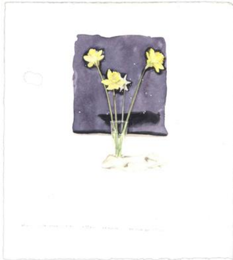
2. Daffodils and Star Map , 1988 watercolor and graphite on Fabriano paper image: 4 3/4 x 3", sheet: 8 1/4 x 7 3/8", frame: 14 x 11"