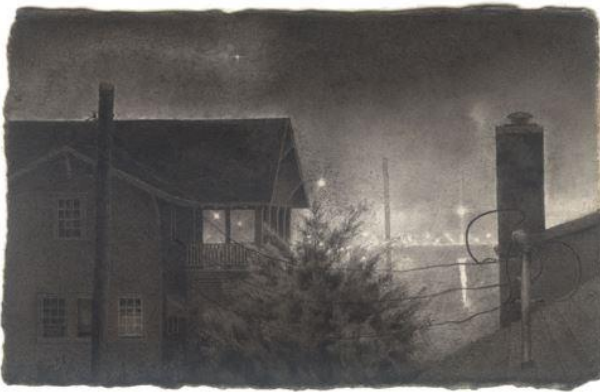
31. Sound Lights , 1982 pen and ink and wash on Fabriano paper image: 3 3/8" x 5 1/4", sheet: 3 3/8" x 5 1/4", frame: 11 x 14"