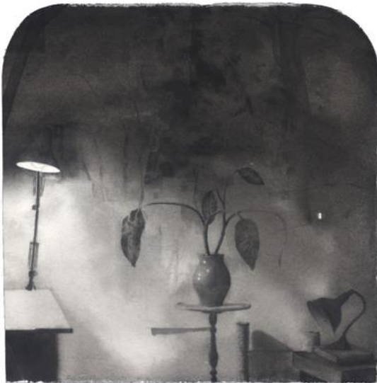
16. Night Studio with Diffenbachia , 1985 watercolor and graphite on Fabriano paper image: 4 7/8 x 4 7/8", sheet: 4 7/8 x 4 7/8", frame: 11 1/2 x 11 1/2"