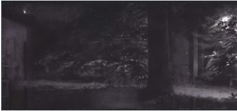
27. Self-Portrait with Night X, 2006 watercolor, conté crayon, and graphite on Fabriano paper image: 5 1/2 x 12", sheet: 5 1/2 x 12", frame: 13 x 20"