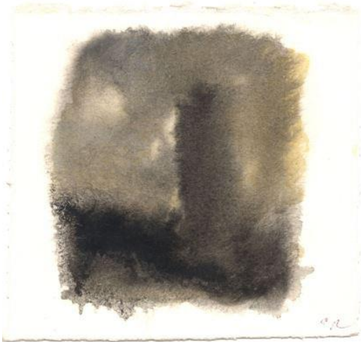
30. Skyscraper , 1978 acrylic and tempera paint on wove paper image: 3 3/4 x 3 3/8", sheet: 4 1/4 x 4 1/2", frame: 14 x 11"