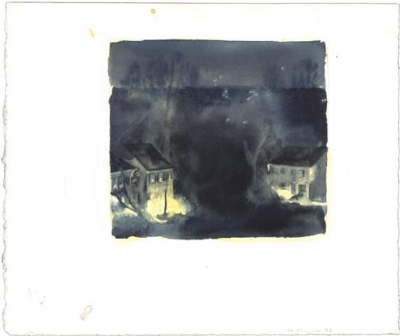
1. Cul-de-Sac , 1993 watercolor and graphite on Fabriano paper image: 6 1/8 x 7 1/4", sheet: 6 1/8 x 7 1/4", frame: 11 x 14"