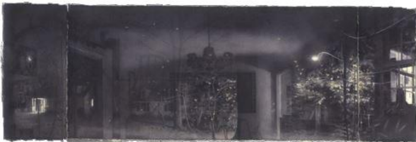
26. Self-Portrait with Night: Side Panels I , 2006-2008 watercolor and graphite on Fabriano paper image: 5 3/4 x 17 1/4", sheet: 5 3/4 x 17 1/4", frame: 11 3/4 x 23 1/2"