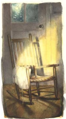
21. Rocking Chair in Sunlight , 1989 watercolor, graphite, and pen and ink on Fabriano paper image: 6 7/8 x 5 3/8", sheet: 9 1/8 x 8 1/4", frame: 14 x 11"