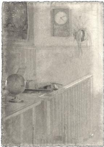
33. Studio Corner with Clock , 1992 watercolor and graphite on Fabriano paper image: 2 7/8 x 2", sheet: 2 7/8 x 2", frame: 11 x 9"