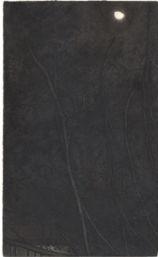
8. Gibbous Moon , 1984 watercolor, pen and ink, and graphite on Fabriano paper image: 6 1/2 x 4", sheet: 6 1/2 x 4", frame: 14 x 11"