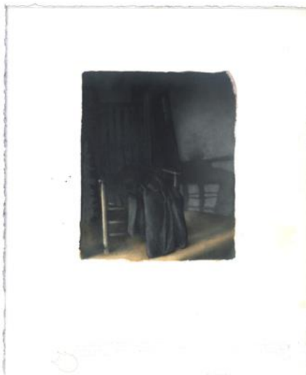
3. Dark Rocker , 1988 watercolor, graphite, and pen and ink on Fabriano paper image: 4 3/8 x 3 5/8", sheet: 8 5/8 x 7 1/8", frame: 14 x 11"