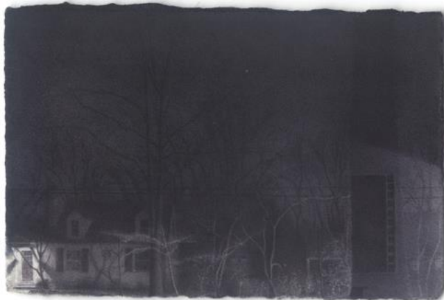
38. Three Inch Suite VI: Self-Portrait with Antares , 2006-2008 watercolor, graphite, and pen and ink on Fabriano paper image: 3 x 4 3/8", sheet: 3 x 4 3/8", frame: 11 x 14"