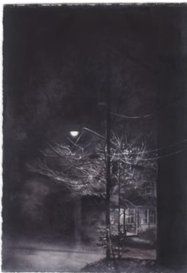
32. Streetlight and Porchlight , 2008 watercolor and graphite on Fabriano paper image: 10 1/2 x 7 1/4", sheet: 10 1/2 x 7 1/4", frame: 17 x 14"