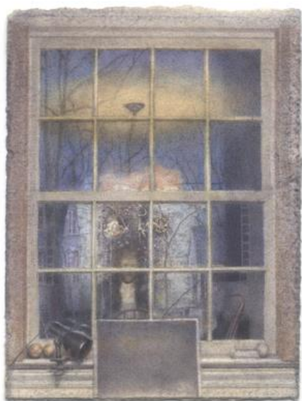
23. Self-Portrait with Blossoming Star Magnolia , 2002-2008 watercolor, graphite, and gouache on Fabriano paper image: 4 x 3", sheet: 4 x 3", frame: 14 x 11"