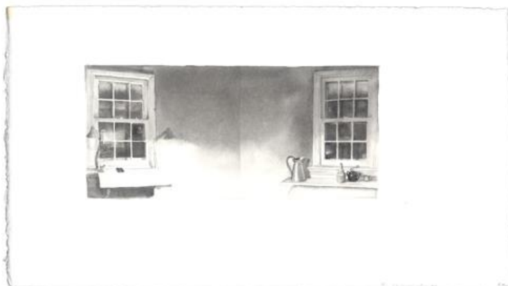
39. Two Windows: 18-21 November 1986 , 1986 watercolor and graphite on Fabriano paper image: 2\frac{7}{8} \times 6\frac{1}{4} ", sheet: 6 \times 10\frac{3}{4} ", frame: 11 \times 16 "