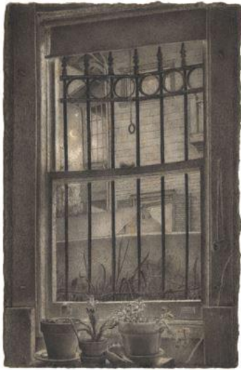
42. Window with Moon and Star , 1983 pen and ink, graphite, and watercolor on Fabriano paper image: 4 1/4", sheet: 2 3/4", frame: 14 x 11"