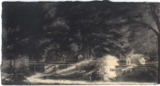
12. Late Sun , 1990-1996 watercolor, graphite, conte crayon, litho crayon, and pen and ink on Fabriano paper image: 5 1/4 x 9 7/8", sheet: 5 1/4 x 9 7/8", frame: 11 1/2 x 16 1/2"