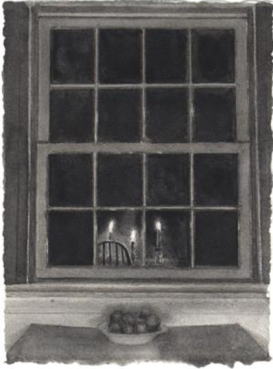
36. Three Candles , 1998 watercolor, graphite, and pen and ink on Fabriano paper image: 4 1/4 x 3", sheet: 4 1/4 x 3", frame: 17 x 13"