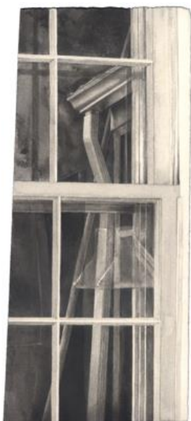
40. Window with Downspout , 1985 watercolor and graphite on Fabriano paper image: 6\frac{3}{8} \times 2\frac{5}{8} ", sheet: 6\frac{3}{8} \times 2\frac{5}{8} ", frame: 14 \times 11 "