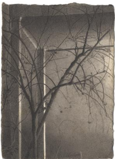
14. Light under Porch , 1981 pen and ink, graphite, and wash on Fabriano paper image: 3 3/4 x 2 3/4", sheet: 3 3/4 x 2 3/4", frame: 14 x 11"