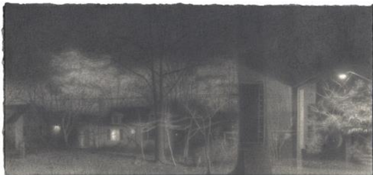
11. Landscape in Graphite I , 2007-2008 graphite on Fabriano paper image: 5 5/8 x 12", sheet: 5 5/8 x 12", frame: 11 x 19"