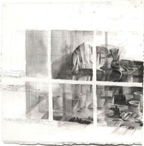
18. Reflected Worktable: 12 November 1985, 1985 watercolor, graphite, and pen and ink on Fabriano paper image: 7 9/16 x 7 1/2", sheet: 7 9/16 x 7 1/2", frame: 16 x 13 1/2"