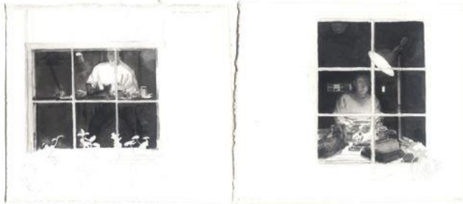
4. Drawing with Cat : 18 December 1985 - 6 February 1993, 1993 watercolor and graphite on two sheets of Fabriano paper image: two panels overall: 4 1/4 x 9 1/2", sheet: two panels overall: 4 1/4 x 9 1/2", frame: 11 x 16"