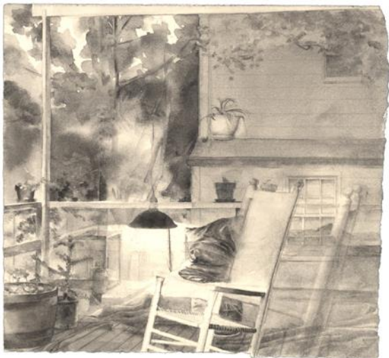
20. Reflection with Rocking Chair and Pillows, 1985 watercolor and graphite on Fabriano paper image: 5 1/4 x 5 3/4", sheet: 5 1/4 x 5 3/4", frame: 11 x 14"