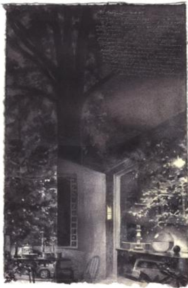
34. Summer Night with Interior , 2007 watercolor, graphite, and white pen and ink on Fabriano paper image: 4 1/2 x 4 1/4", sheet: 4 1/2 x 4 1/4", frame: 14 x 11"