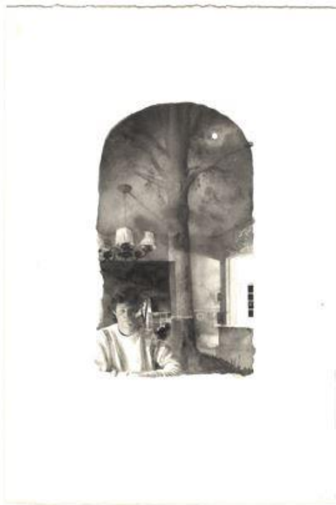
25. Self-Portrait with Full Moon and Tree: Second Study , 1988 watercolor, graphite, and pen and ink on Fabriano paper image: 2 3/4 x 4 3/8", sheet: 8 5/8 x 5 7/8", frame: 14 x 11"