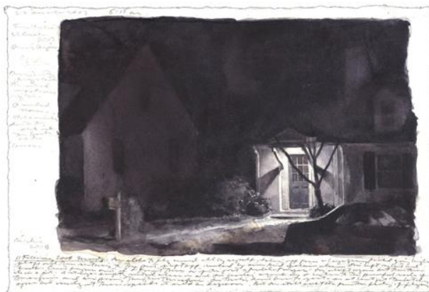
7. Front Porch Light , 2007-2008 watercolor, graphite, and pen and ink on Fabriano paper image: 4 x 6", sheet: 4 x 6", frame: 11 x 14"