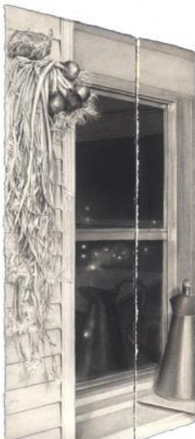
17. Paper Whites and Pitcher , 1984 watercolor, graphite, and pen and ink on Fabriano paper image: 10 1/4 x 4 1/2" two panels, sheet: 10 1/4 x 4 1/2" two panels, framed 14 x 11"