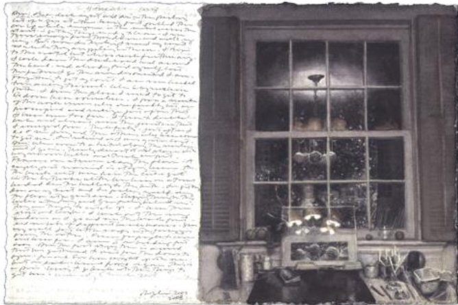
24. Self-Portrait with Double Reflection , 2007-2008 watercolor, graphite, and pen and ink on Fabriano paper image: 4 x 6", sheet: 4 x 6", frame: 11 x 14"