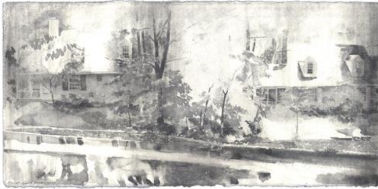
15. Midday Rain , 1994-2007 watercolor and graphite on Fabriano paper image: 4 7/8 x 9 3/4", sheet: 4 7/8 x 9 3/4", frame: 11 1/2 x 16 1/2"