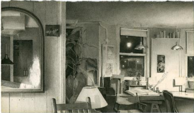
5. Erased Self-Portrait , 1983 watercolor, graphite, and pen and ink on Fabriano paper image: 4 x 7", sheet: 4 x 7", frame: 11 x 14"