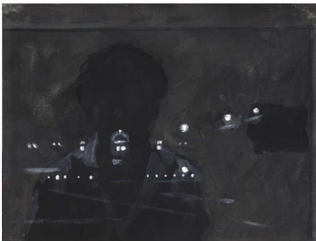
22. Self-Portrait: Pittsburgh , 1979 acrylic and tempera paint on wove paper image: 6 x 7 1/4", sheet: 6 x 7 1/4", frame: 12 3/4 x 14 3/4"