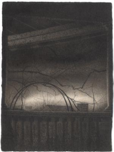
13. Light through Porch , 1981 pen and ink, graphite, and wash on Fabriano paper image: 3 3/4 x 2 3/4", sheet: 3 3/4 x 2 3/4", frame: 14 x 11"