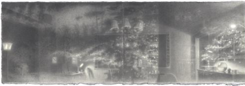
6. Folded Self-Portrait with Night I: Graphite , 2007 graphite on Fabriano paper image: 4 1/4 x 12 1/4", sheet: 4 1/4 x 12 1/4", frame: 11 x 19"