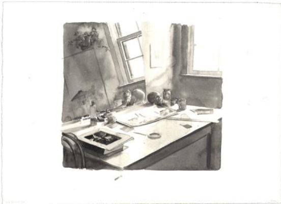
43. Worktable: 22 September 1990 , 1990 watercolor, graphite, and pen and ink on Fabriano paper image: 5 1/2 x 5 3/4", sheet: 7 3/8 x 10 5/16", frame: 11 x 14"