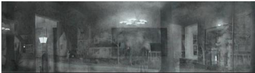
9. Interior/Exterior , 1989 watercolor, graphite, and pen and ink on Fabriano paper image: 18 x 37", sheet: 8 1/8" x 29 3/8", frame: 16 x 37 1/2"