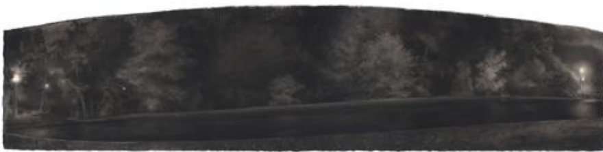
35. The Bend , 1984 watercolor and graphite on Fabriano paper image: 3 5/8 x 14 7/8", sheet: 3 5/8 x 14 7/8", frame: 9 1/2 x 21"