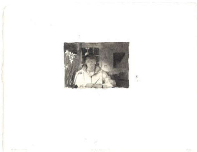
29. Self-Portrait: 10 March 1988 , 1988 watercolor and pen and ink on Fabriano paper image: 1 3/4 x 2 1/2", sheet: 5 7/8 x 7 3/4", frame: 9 x 11"